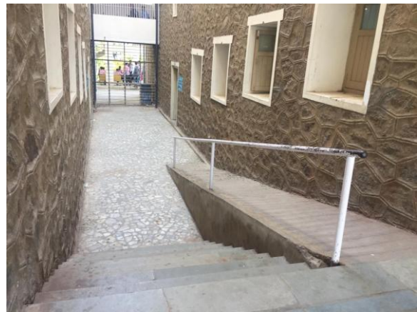
Near commerce staffroom