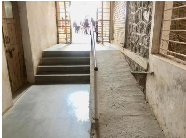
Near room no.2 & room no.3